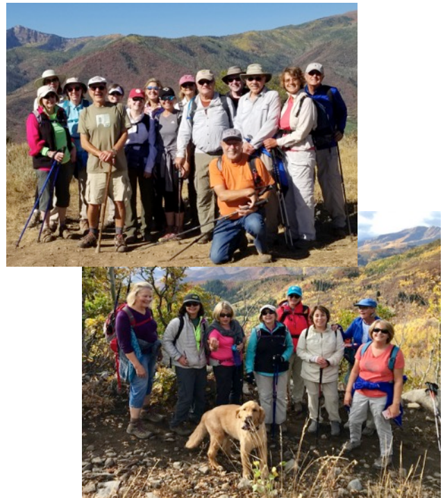
Hiking on Phosphate Hill & Upper WOW