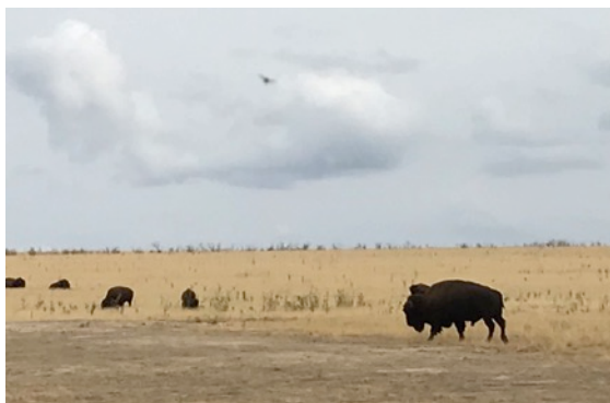
Antelope Island – 1 st VP Event for October

Join us for dinner at Brio in the City Creek Center. Then we will walk to Temple Square to view the holiday lights. If you want to attend the Tabernacle Choir rehearsal, it begins at 7:30.