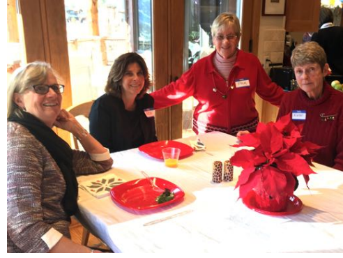
Holíday Book Club