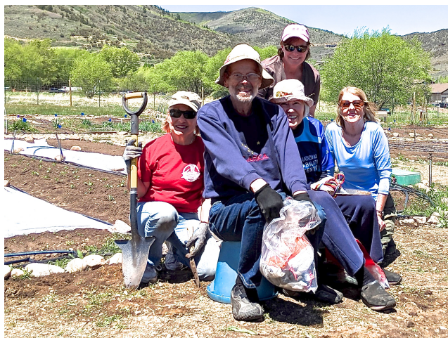
May Service Project at Summit Community Gardens

The perennial swap is a great way to share the abundance in our gardens. Everyone should come with a nice size labeled perennial in a pot. Please dig and pot your plant 3-4 weeks ahead of the swap so that it becomes acclimated to the pot and doesn't look half dead! (You can purchase a perennial if needed.) We want to share perennials that we know will grow in Park City!