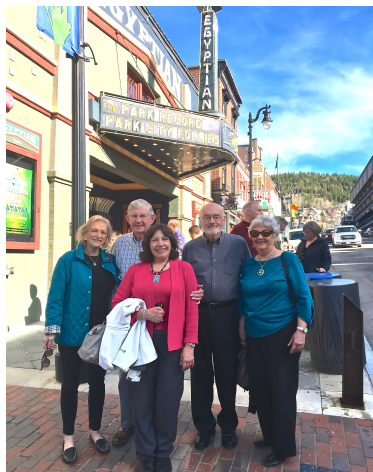
May 1 st VP Event – Night at the Follies