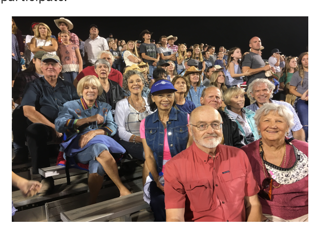
Newcomers at the Wasatch Rodeo

http://pcmscorg.ipage.com/pcmsc/calendar/ where you will find each week's times and routes. Members will need to complete a PCMSC Activity Release Form to participate.