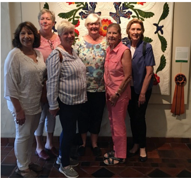
Lunch & Leisure at the Quilt Show

ALSO , everyone brings an hors d'oeuvre to share. (No chips and dips, please.)