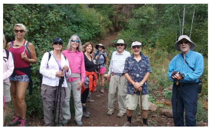
Hiking at Lake Solitude