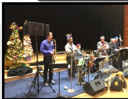
The band and dancing made for a great time.