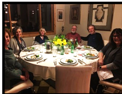
Enjoying an evening of Fine Dining