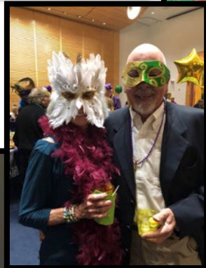
The costumes and masks were fabulous.