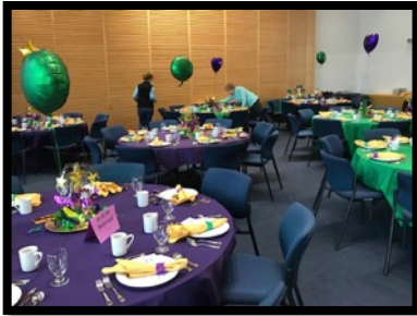
Loved the decorations.